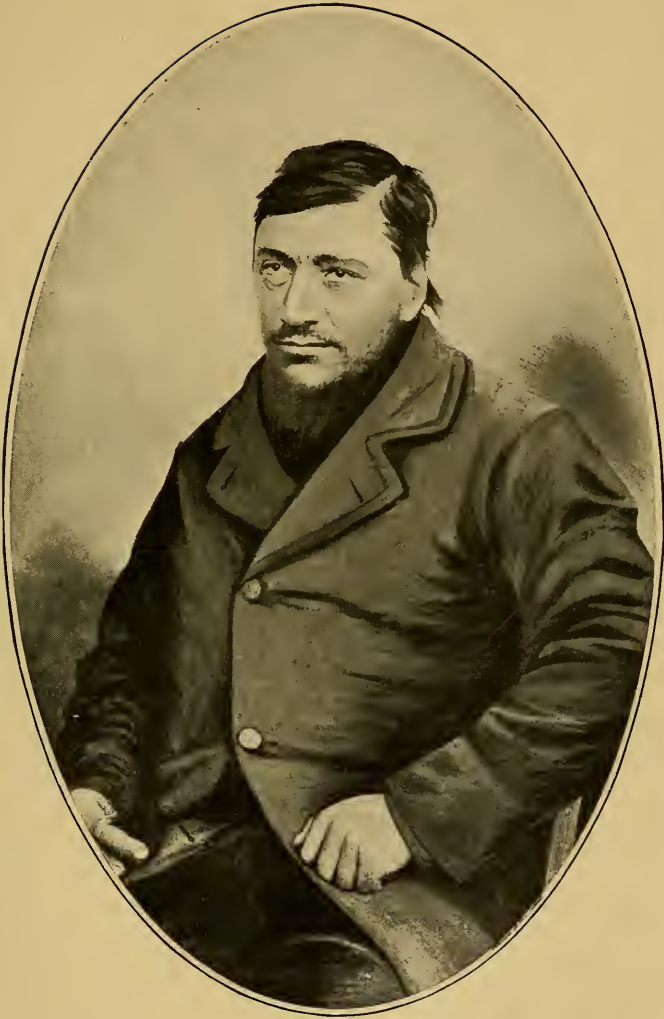
STEPHANUS JOHANNES PAULUS KRUGER